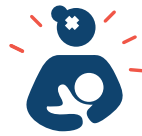
Mother Treated Violently